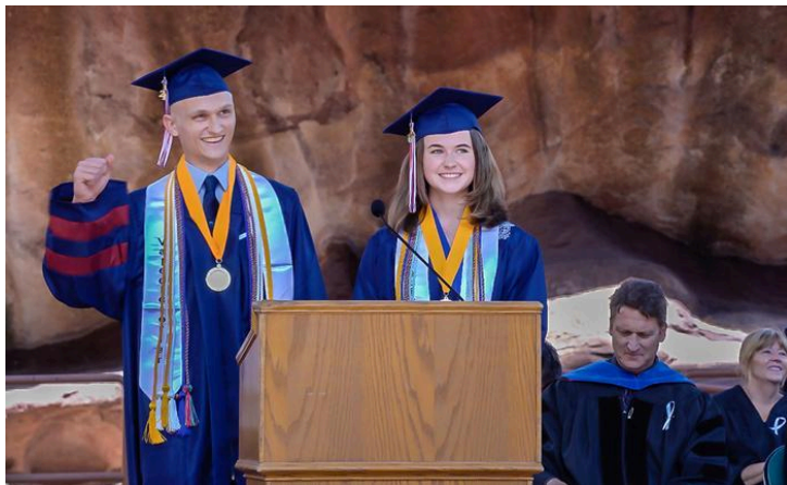
Dakota Ridge graduates celebrate at Red Rocks during a graduation ceremony in 2022.